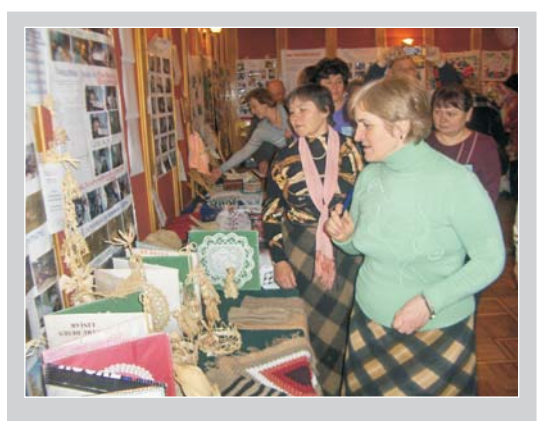
Exhibition of older people handicraft work, Carabetovca

their efforts to tap onto in-country funding mechanisms.